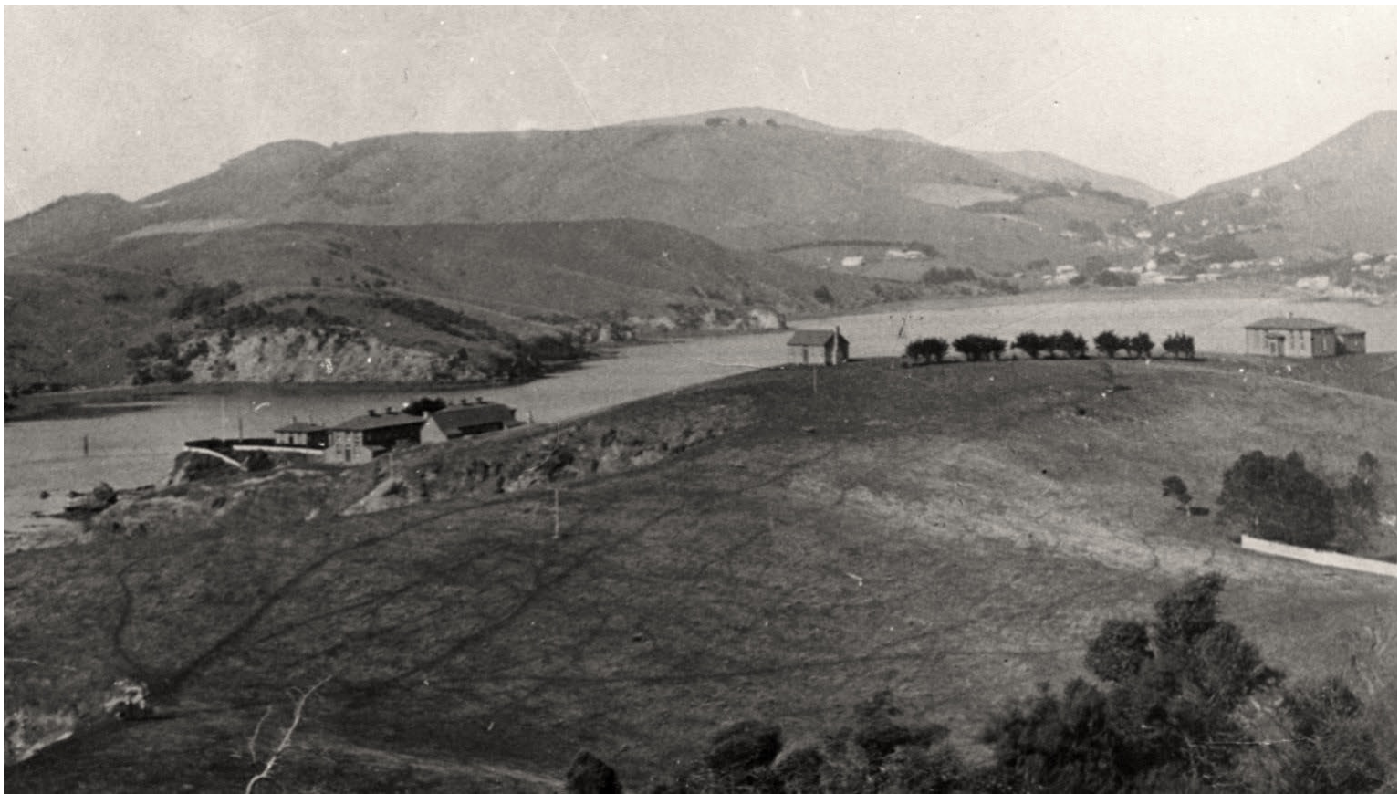
Quarantine Station buildings ca 1900. The main buildings are to the left, first hospital centre, and second hospital right. The cemetery is at the lower right (D De Maus)

In 1916, the ships/hulks were not on the island yet. The Oreti was built in 1900 and carried native timbers from Southland to Dunedin. The steel Waikana (1909) was taking regular passenger services along the bays from Dunedin to Portobello. In 1916 perhaps either ship could have been seen in the distance.