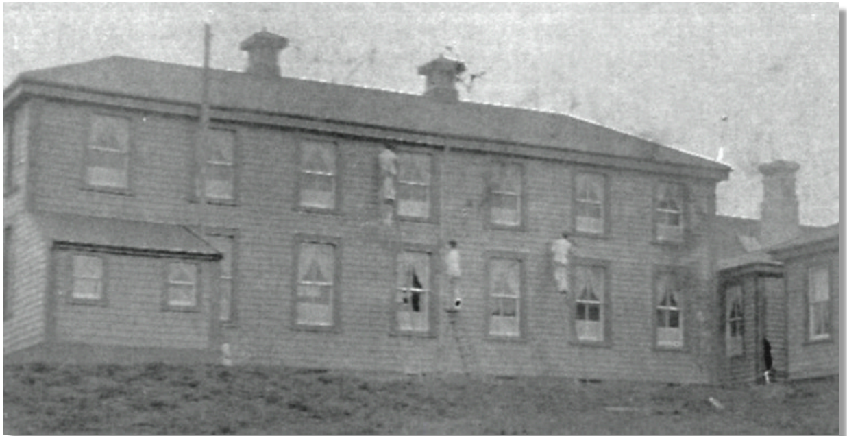
Soldiers painting the Single Women's Quarters. Lace curtains had been whitewashed on the windows by the girls before the war, when they had the run of the Island.

Take the path up to the main hospital site. This was probably used to treat the soldiers, but the ablution block (now woolshed) might also have been used.