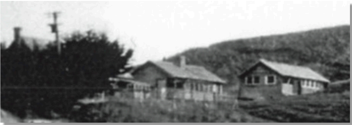
Staff recreation hut and ablutions, 1861 Building behind tree (JE McEwan, ca 1950)

The cottage in front of you was extended in 1989-90 from the recreation hut built in 1915. Walk to the concrete tank below the cottage and look back up. The shape of the original building can still be seen.