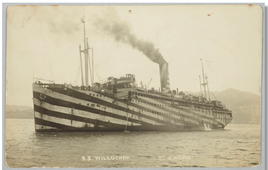
The troopship Willochra in dazzle camouflage 1918.

There was some extension of the store-rooms behind the Married Quarters, but it was kept much the same. About sixty men were here at any one time. However, when the troopship Willochra returned in May 1916 with two cases of smallpox, all 231 men had to go into quarantine.