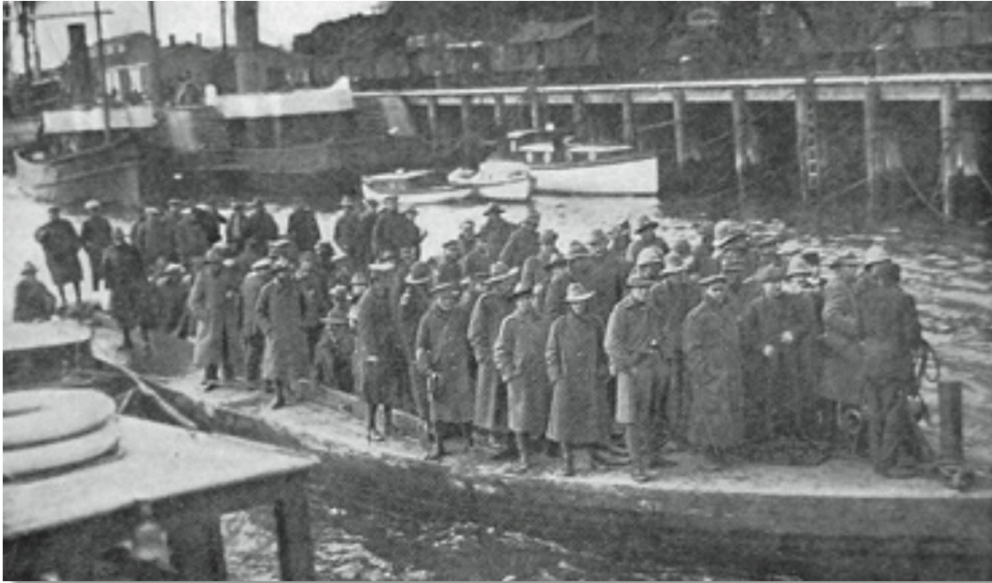
Soldiers from the Willochra (Otago Witness, 7/6/1916)

The keeper's daughters were sent to board in town while the Willochra soldiers were here in 1916, and the existing soldiers with VD hastily sent to the old prison and barracks at Taiaroa head. One Willochra man died of smallpox and was buried at the cemetery in 1916 the last burial on the island. In 1947 his body was moved to the Andersons Bay Cemetery.